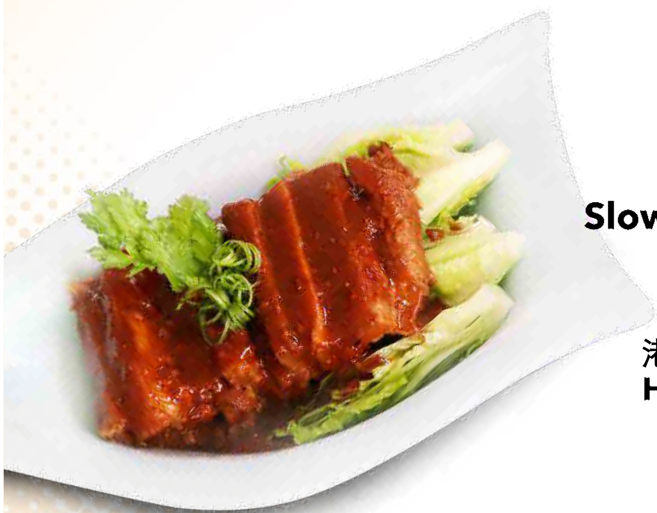
香芋黑豚扣肉 Slow Cook Kurobuta Pork Belly with Taro