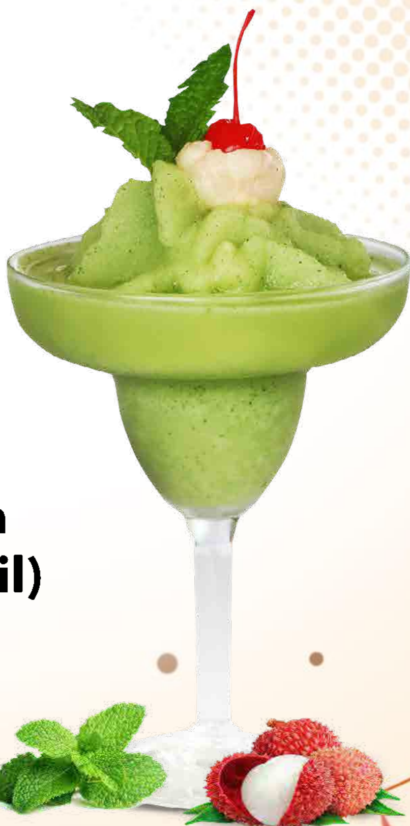
荔枝薄荷冰沙 Lychee Mint Limona (無酒精雞尾酒 Mocktail )