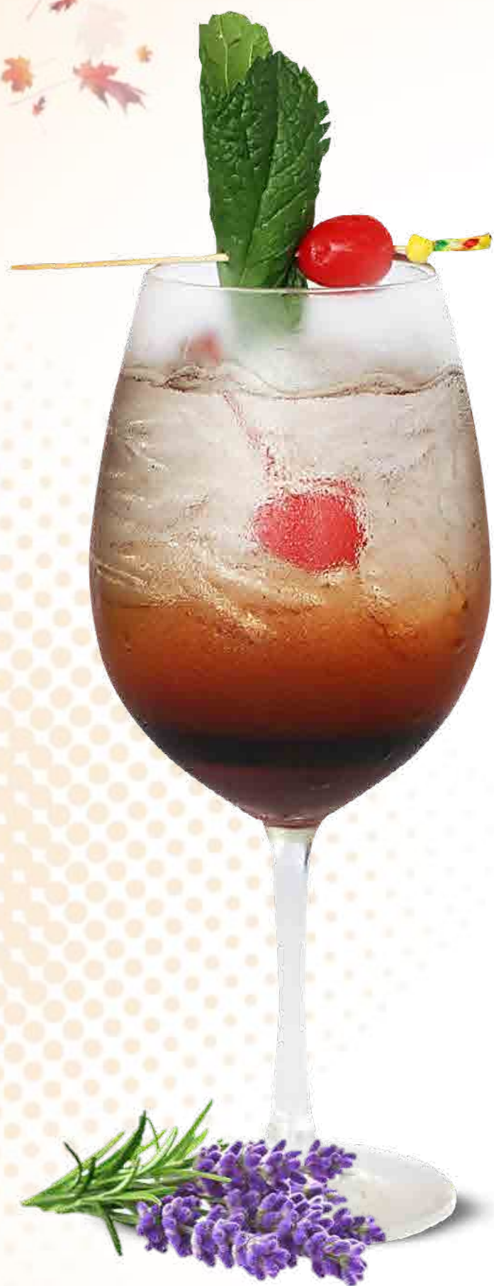
薰衣草黑醋栗檸檬飲 Lavender Cassis Lemonade (雞尾酒 Cocktail )